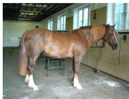
Horse standing normally after treatment with Imprint®