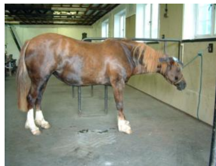
Horse before treatment showing typical laminitic stance

The shoes are generally fitted in pairs as laminitis normally affects either both front or hind feet, or in more severe cases, all four feet. The Imprint Equine Foot Care System is prescribed by leading equine veterinarians and fitted by qualified farriers both nationally and internationally.